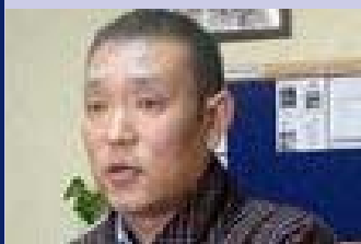
Karma Jurmin Herbal and vegetable packing